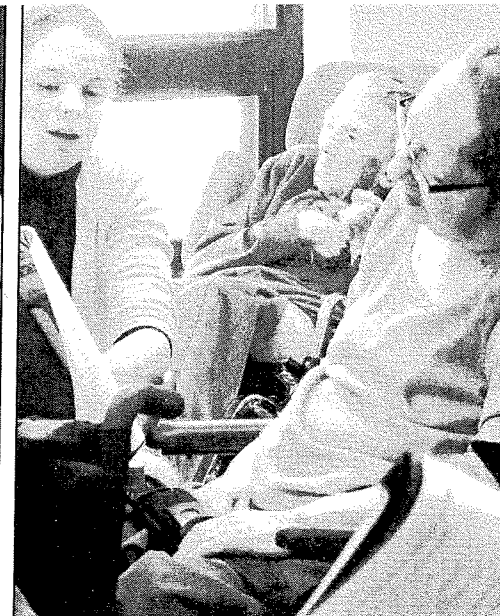
Lakehead University creative community engagement in music students sing Christmas carols with Bethammi Nursing Home residents.